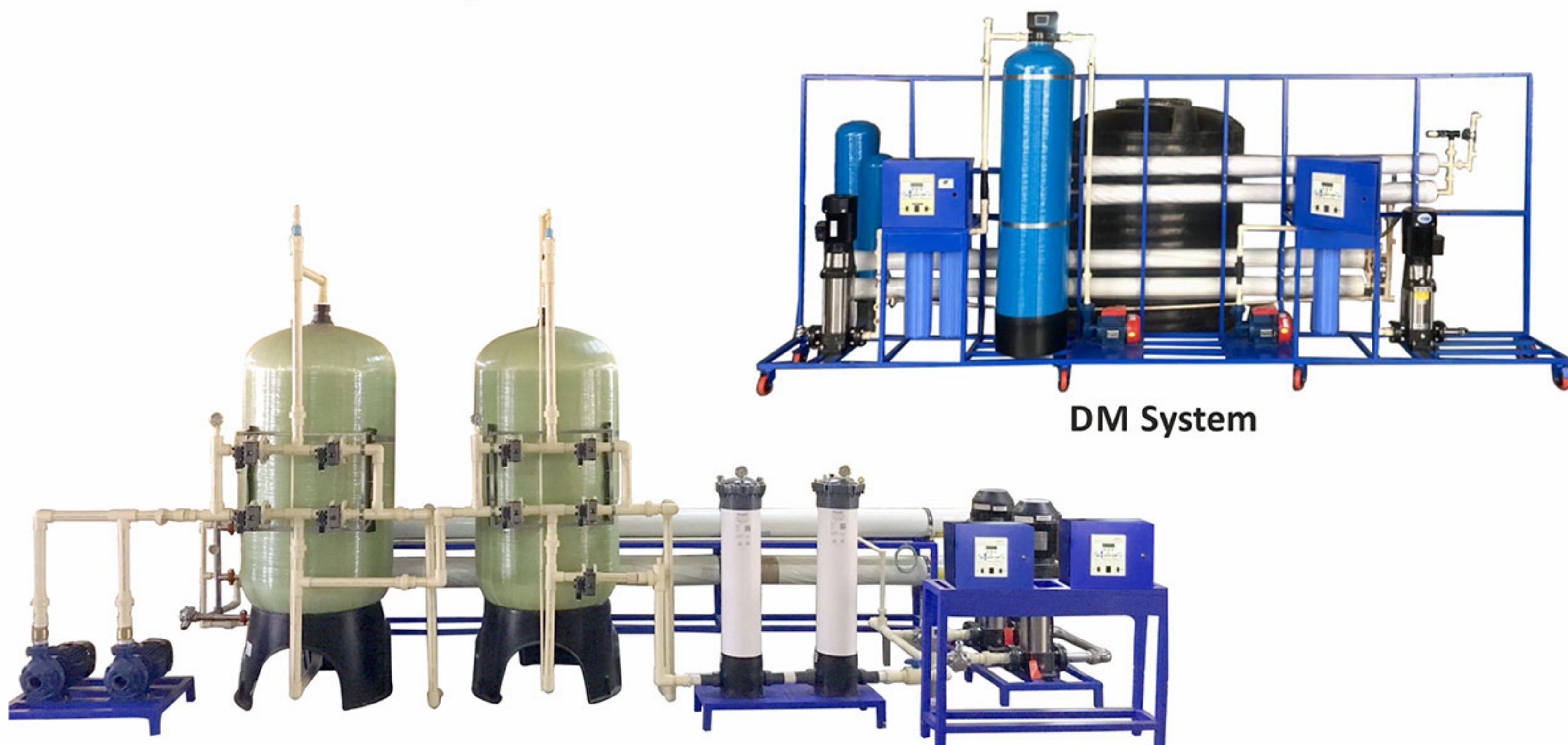
RO 12,000 to 50,000 lph System