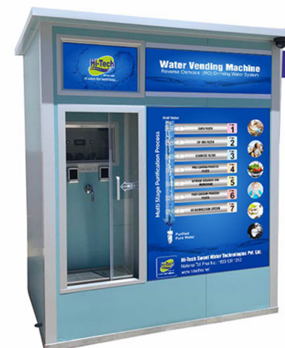
WVM (RO 500 LPH)