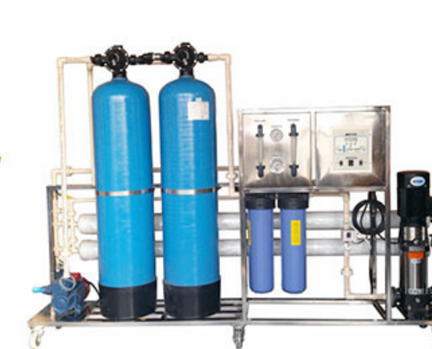
RO Manual System