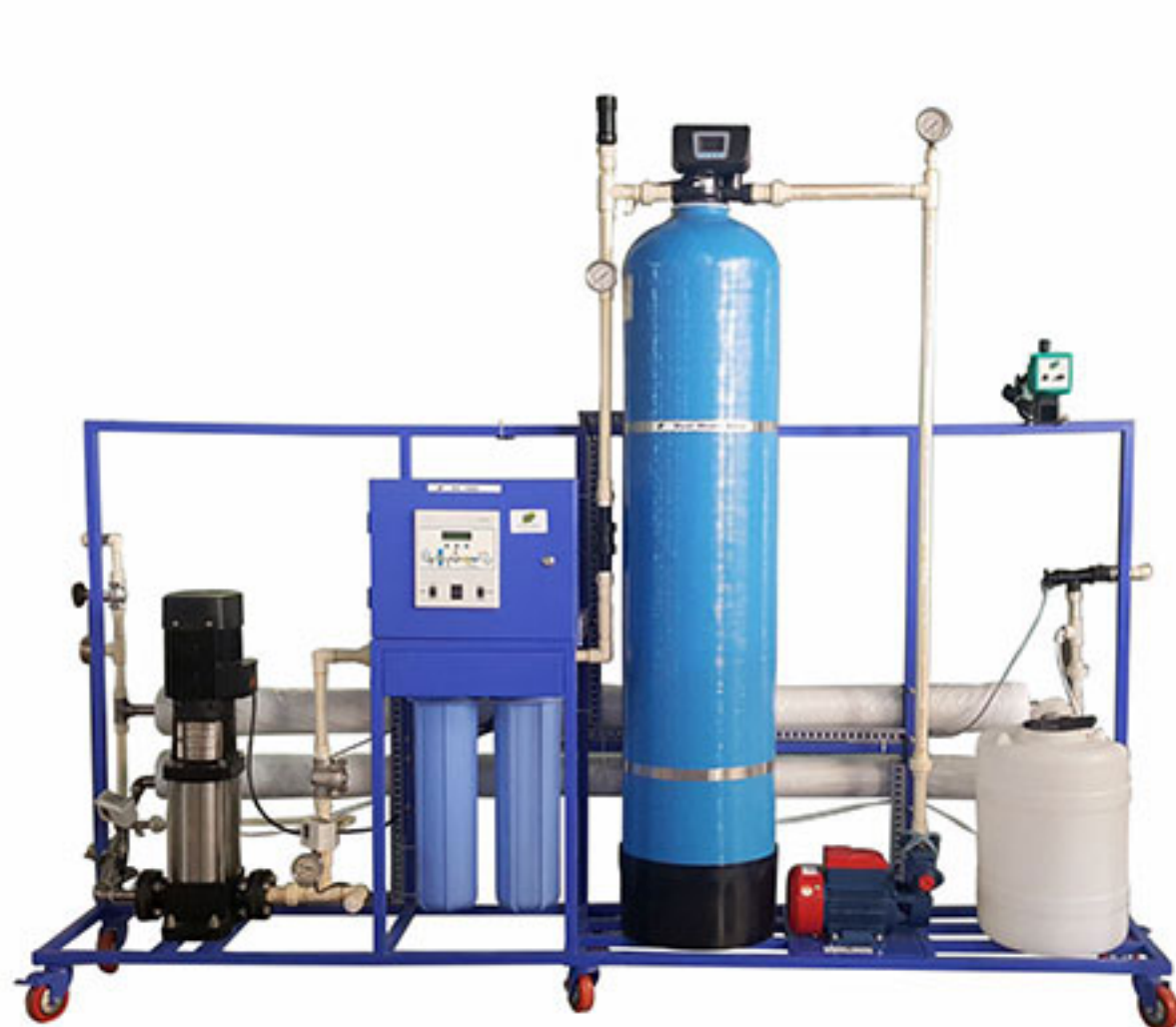
RO 100, 150, 250, 500, 1000 lph