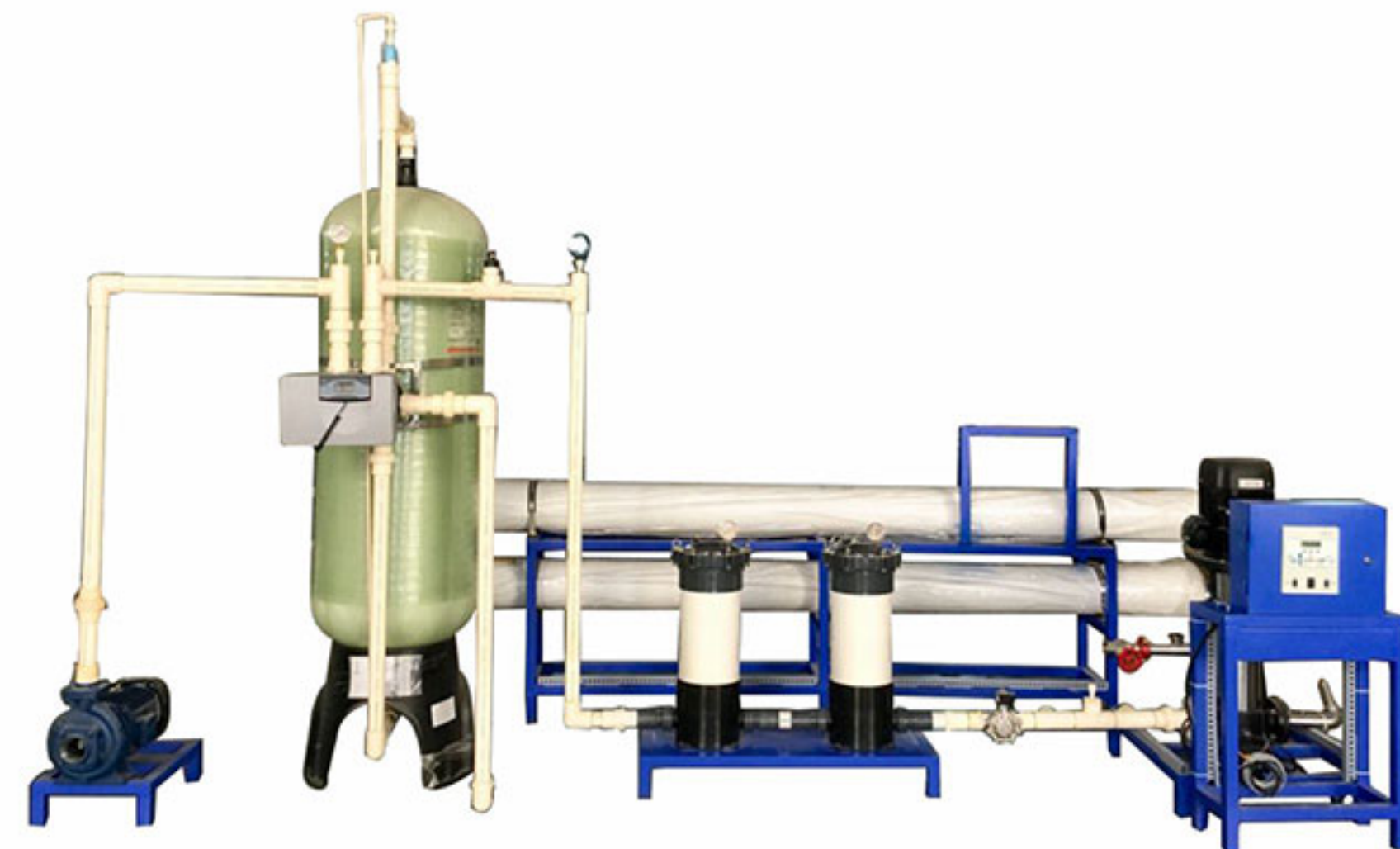
RO 2000 to 10,000 lph