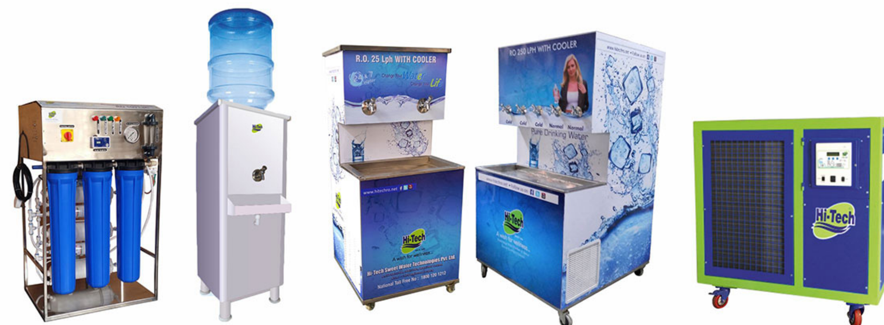
RO 50/100 Lph

R.O. PLANT FOR CORPORATE SECTORS, HOTELS, BANKS, RESTAURANTS