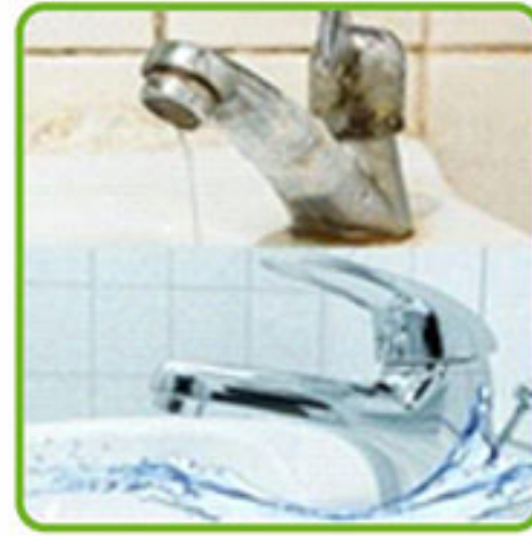
Scaling on Fixtures