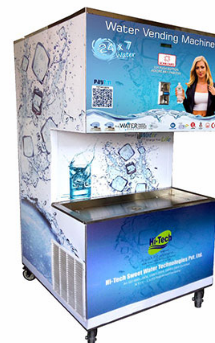
WVM with Cooler (RO 50 TO 250 LPH)