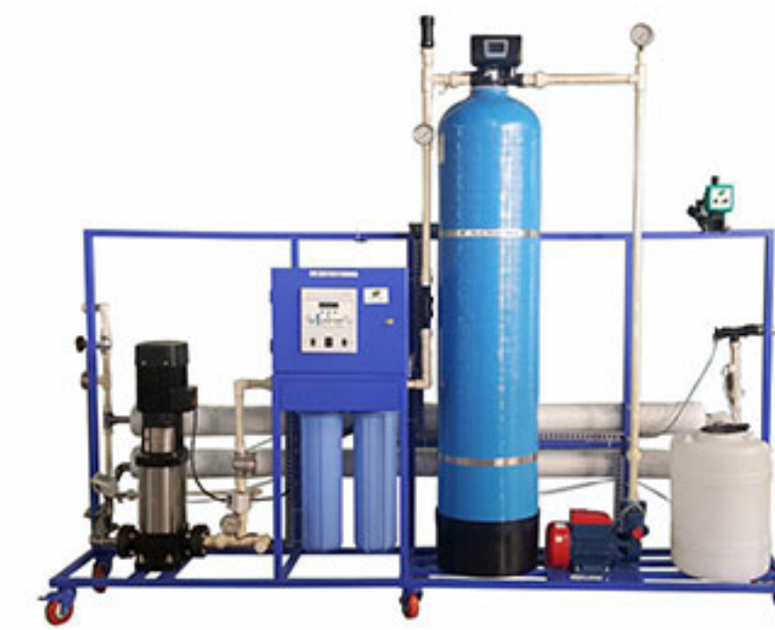
RO Auto System