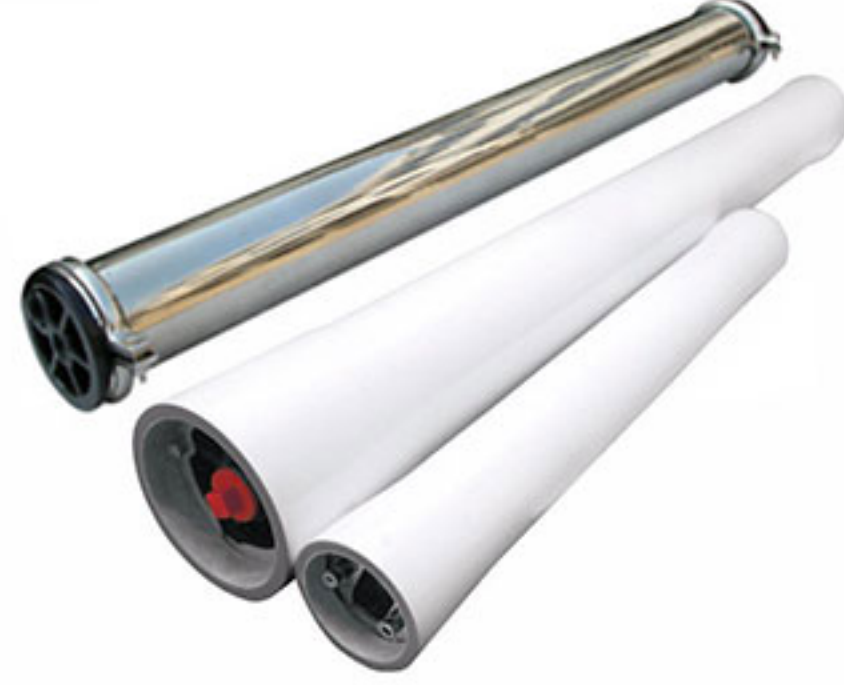
MEMBRANE HOUSING FR and SS Housing