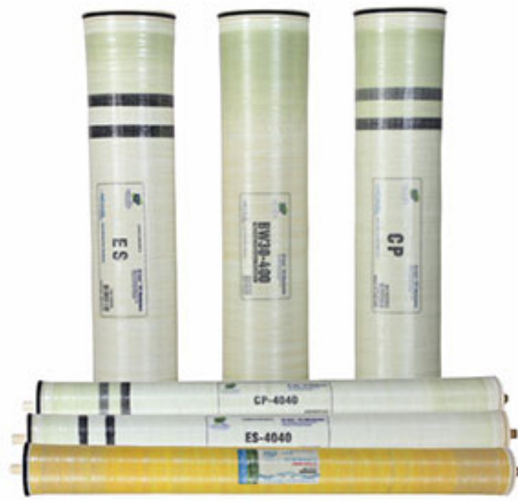
RO MEMBRANE 2540, 4021, 4025, 4040, 8040