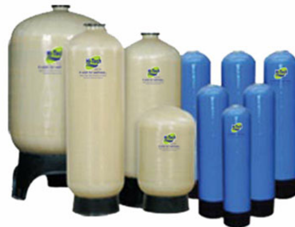
FRP FILTER VESSEL